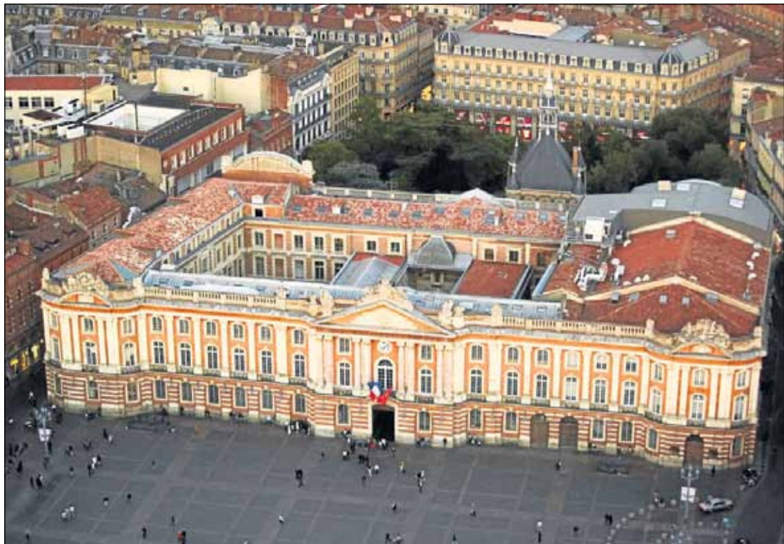
■ The Capitole de Toulouse is the seat of the municipal administration in the city.