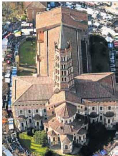
■ St Sernin.