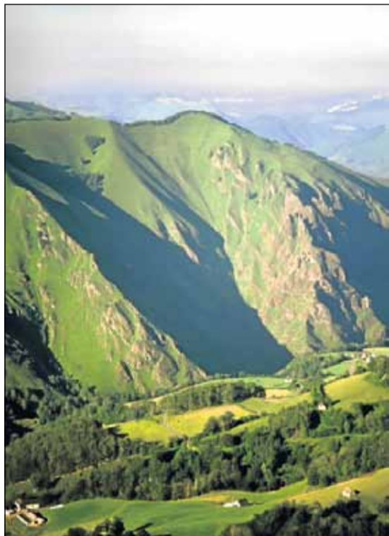
■ The Pyrenees.

than 100 saints and six apostles. Listed by Unesco, it's an amazing place on the route to Santiago de Compostela and dates back to the 13th Century.